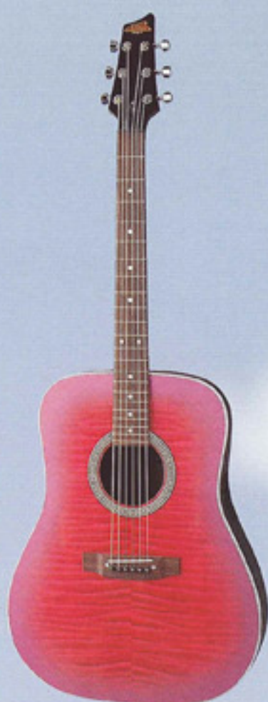
SD22GFE PP (Pearl Pink Sunburst)