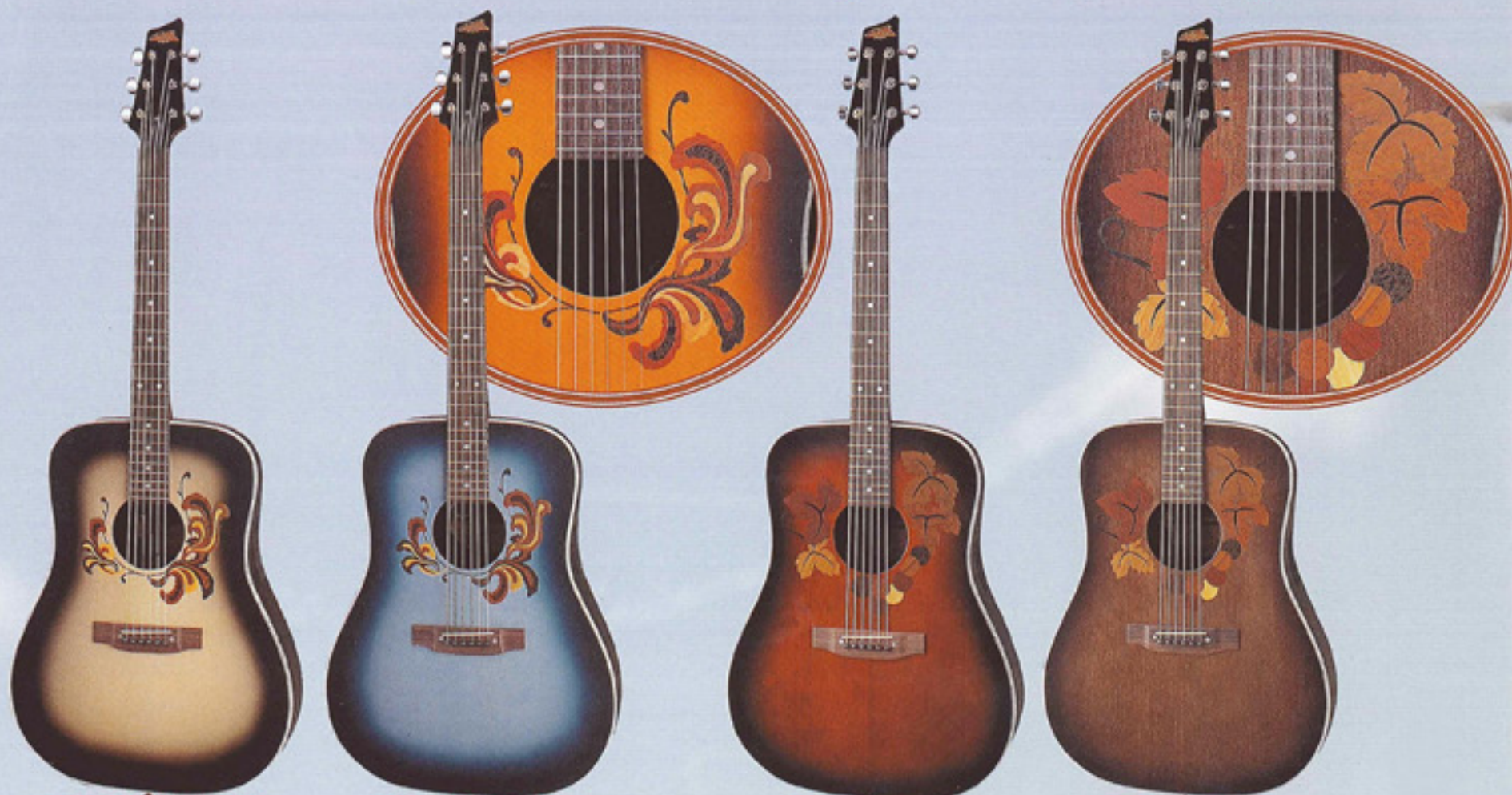
SD14E DBK (Mat Black Sunburst)