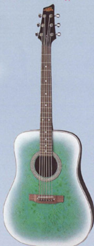
SD22MBE PG (Pearl Green Sunburst)