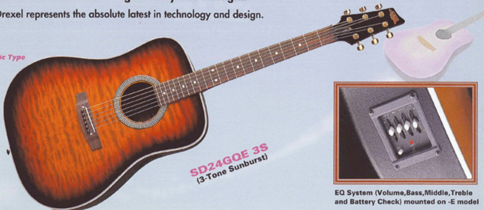
SD24GQE 3S (3-Tone Sunburst)