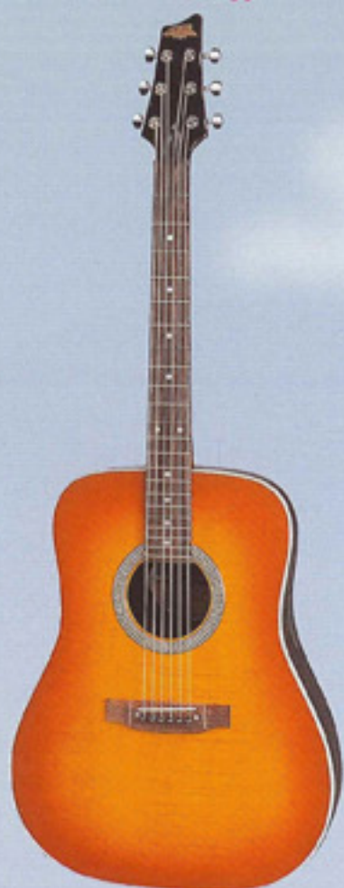
SD20HME LA (Light Amber Sunburst)