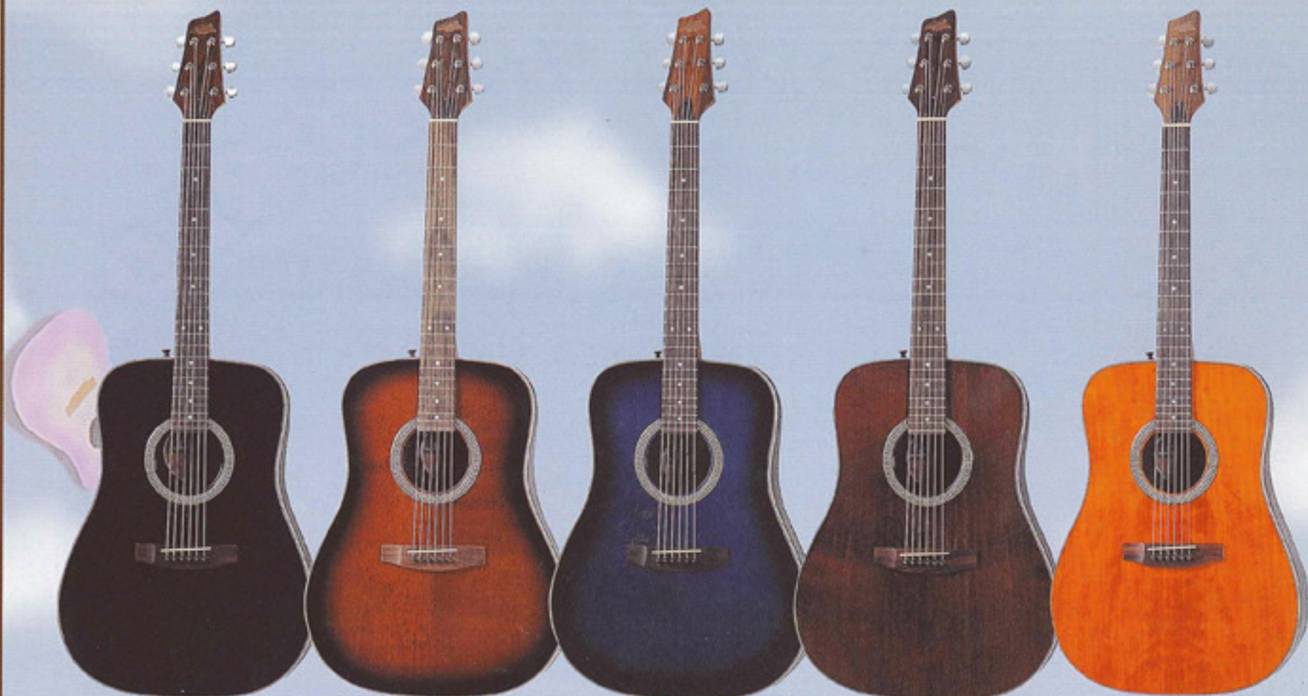
SD8 BK SD8E BK (Black)